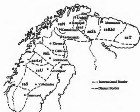
Sápmi and the Sámi Dialect Boundaries.

p.163). State borders did not just divide Sápmi, but language groups and siida territories as well, as shown in Figure 3.