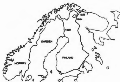
Fennoscandia: International Borders on the Northern Cap

Forced to concede its dominant status and seek stability in the region, Sweden negotiated the Treaty of Strömstad in 1751, which defined the Norwegian-Swedish border (Figure 5 shows this and the subsequent borders which divided Sápmi). An addendum to the treaty, the Lapp Codicil, is perhaps