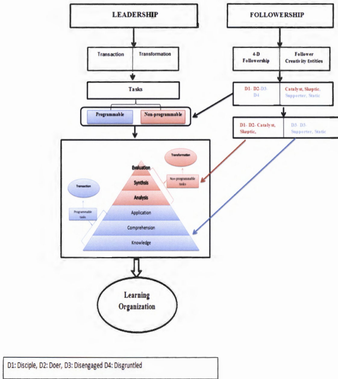
Figure 3: Synthesis of leadership, followership, and learning models.

Intentionally, this figure has two different colors which are blue and red. The blue color indicates basic and lower level whereas the red color symbolizes complex and higher level. Thereby, transactional leadership as a fundamental stage for applying leadership styles is in blue. The blue section represents a lower level of followership types including